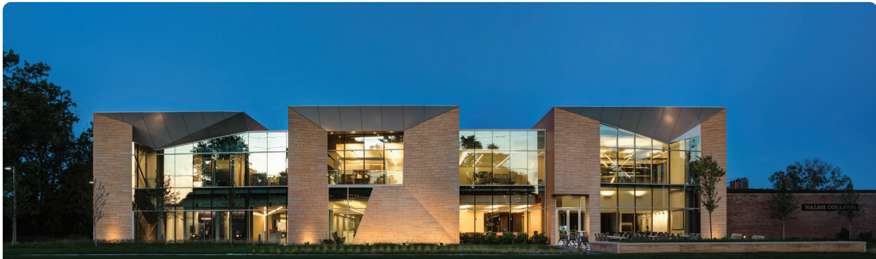
Walsh College, Troy Location

Walsh College , in Troy, Michigan, was designated a Center of Academic Excellence in Information Assurance Education in 2003 and was one of the first schools in Michigan to be designated as a Center of Academic Excellence in Cyber Defense (CAE/CD). Walsh is a private, nonprofit, upper-division school offering undergraduate, graduate, and doctoral business and technology degrees. Our information technology degrees include concentrations in cybersecurity and the nation's first concentration in automotive cybersecurity. A graduate business certificate in cybersecurity is also offered. Walsh's IT degrees align with the Department of Defense and Department of Homeland Security NICE Framework standards and are F1 DHS STEM designated programs. Walsh has been recognized by thebestschools.org for having one of the best online Master's in Network Security in the nation.