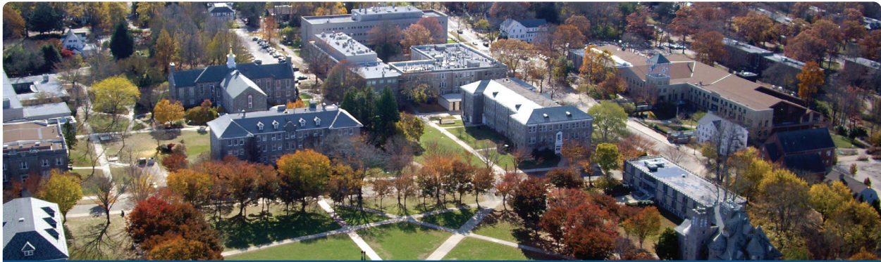
The University of Rhode Island Campus

The University of Rhode Island's Digital Forensics and Cyber Security Center (DFCSC) is a multidisciplinary hub on the Kingston, RI campus that harnesses the resources of Computer Science, Electrical and Computer Engineering, and the Office of Information Technology. Established in 2004 with a grant from the U.S. National Science Foundation, the DFCSC provides courses and degree programs, research, services, and consulting in multiple cyber security disciplines. Its research objective is to formulate new concepts that help digital forensics and cyber security professionals protect the nation's citizens. The DFCSC also focuses on preparing the workforce of tomorrow through extensive outreach into K-12 education in computer science, data science, and cyber security.