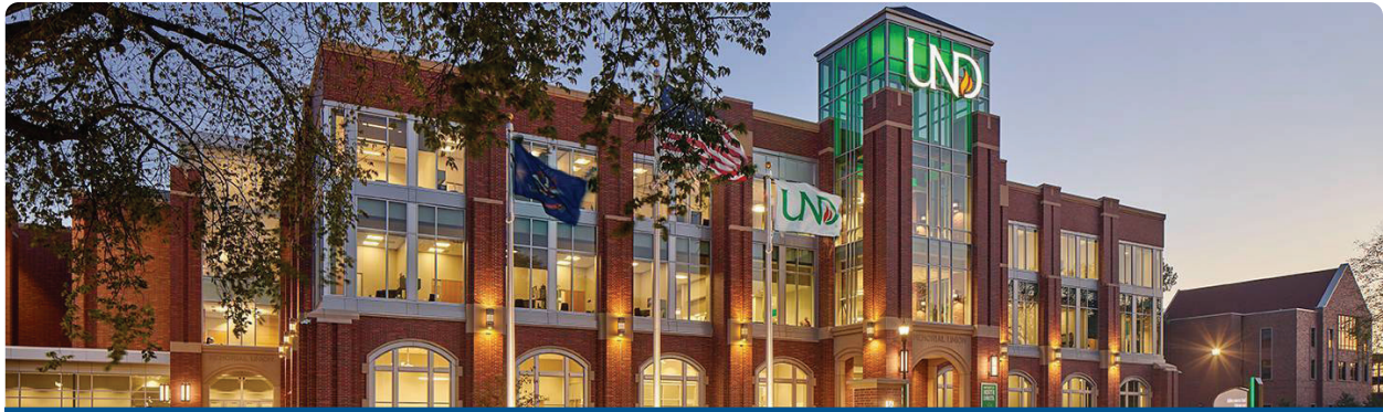
University of North Dakota Memorial Union

In 2017, the School of Electrical Engineering & Computer Science (SE ECS) at the University of North Dakota was established through the merger of the Department of Computer Science and the Department of Electrical Engineering. This unification was driven by the recognition of the vast interdisciplinary opportunities that collaborative teaching and research between these closely aligned fields could unlock. Beyond its foundational disciplines, SE ECS plays a crucial role in supporting the Biomedical Engineering program, offering both M.S. and Ph.D. levels, and actively engages in collaboration with various units within the College of Engineering & Mines and throughout the campus.