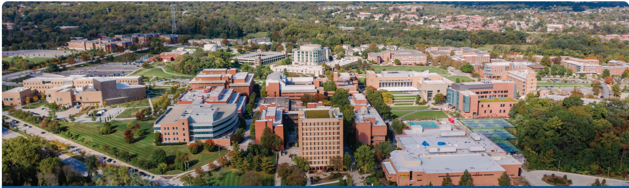
The UMBC Campus.

At University of Maryland, Baltimore County , a Research 1 (R1) university, students study cybersecurity by pursuing a BA or BS, MS, combined BS/MS, or PhD degree through programs in computer science, cybersecurity, computer engineering, and information systems. These degrees are awarded through the Department of Computer Science and Electrical Engineering and Department of Information Systems, where there are tracks in cybersecurity at the undergraduate and graduate levels. UMBC offers scholarships for students to study cybersecurity under the DoD Cybersecurity Scholarship Program (CySP), NSF CyberCorps: Scholarship for Service (SFS), and UMBC CyberScholars.