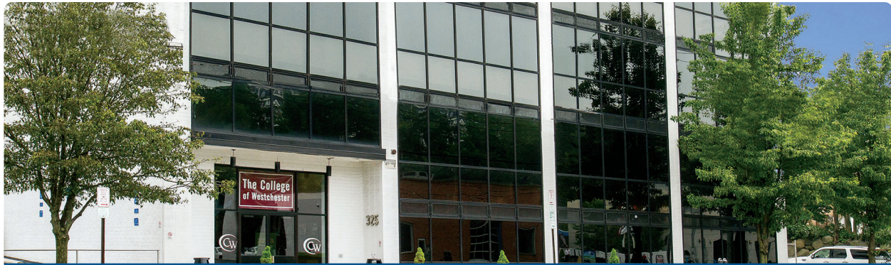
The College of Westchester

The School of Information Technology at the College of Westchester offers degrees that prepare graduates for a dynamic career in the diverse field of Information Technology (IT) as well as satisfies the industry's demand for IT professionals in the following areas: network technologies, network administration, programming, database administration, network and cyber security, and service and support of systems and users.