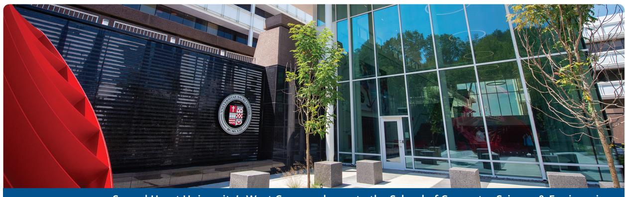
Sacred Heart University's West Campus, home to the School of Computer Science & Engineering

Sacred Heart University's unique Master of Science in cybersecurity program is designed for both students from all majors and working professionals, imparting requisite skills to effectively address the constantly changing threat landscape faced by people, companies and governments today. Sacred Heart's cybersecurity courses are taught using a hands-on learning approach by subject matter experts with extensive experience from the academic and corporate worlds. A dedicated cybersecurity lab provides a collaborative learning environment to simulate cyber threats, design responses and defense strategies. The lab is used to support education, research training and community outreach in cybersecurity and privacy.