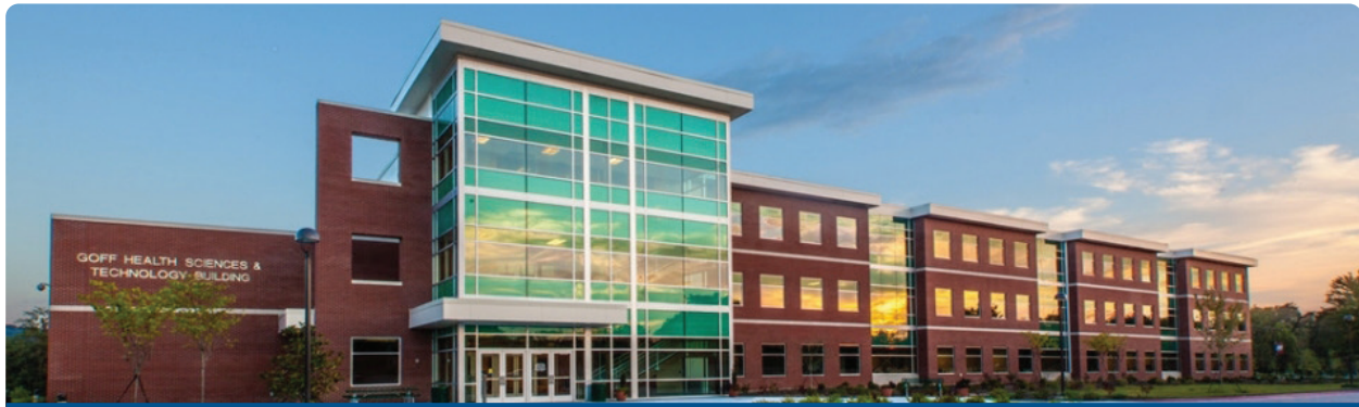
The Goff Bldg. where the cyber lab is housed

Roane State Community College is a two-year institution with nine locations, online classes, and evening classes that helps you fit college into your schedule. Our low cost and many financial aid options will help you afford college.