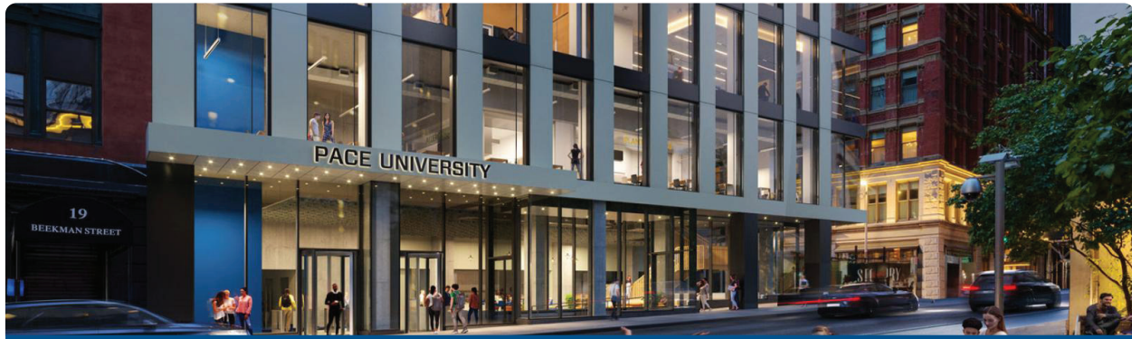
Seidenberg School in New York City

The Seidenberg School of Computer Science and Information Systems at Pace University (Pace) offers robust academic programs for students to focus on cybersecurity topics such as cyber defense and threats, cryptography, biometrics, security design principles, web security, network and device forensics, human-centered attacks, information security policy, cybersecurity analytics, and machine learning.