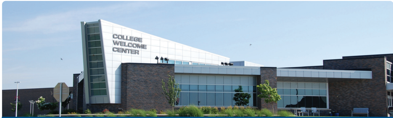
Northeast Welcome Center

Established in 1973 by the State Legislature, Northeast Community College is a comprehensive two-year college located on the northeast edge of Norfolk, Nebraska. It uniquely offers a broad spectrum of educational opportunities on one main campus, including vocational/technical programs, liberal arts, college transfer courses, and continuing education. As the sole community college in Nebraska that combines one- and two-year vocational, liberal arts, and adult education programs in a single location, Northeast serves a vital role in the educational landscape of the state.