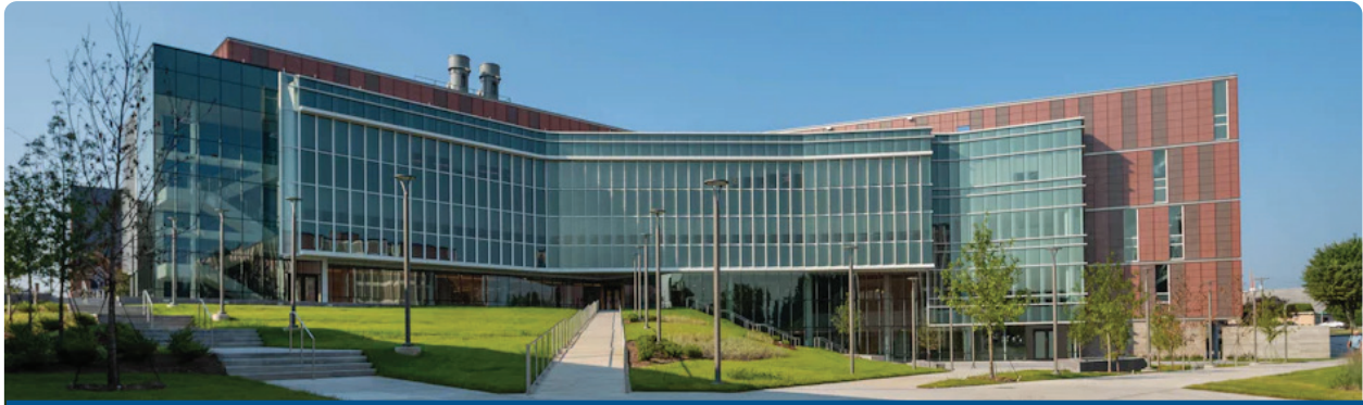
North Carolina A&T Martin Complex

North Carolina Agricultural and Technical State University (also known as North Carolina A&T State University, North Carolina A&T, N.C. A&T, or simply A&T) is a public, historically black, land-grant research university in Greensboro, North Carolina.