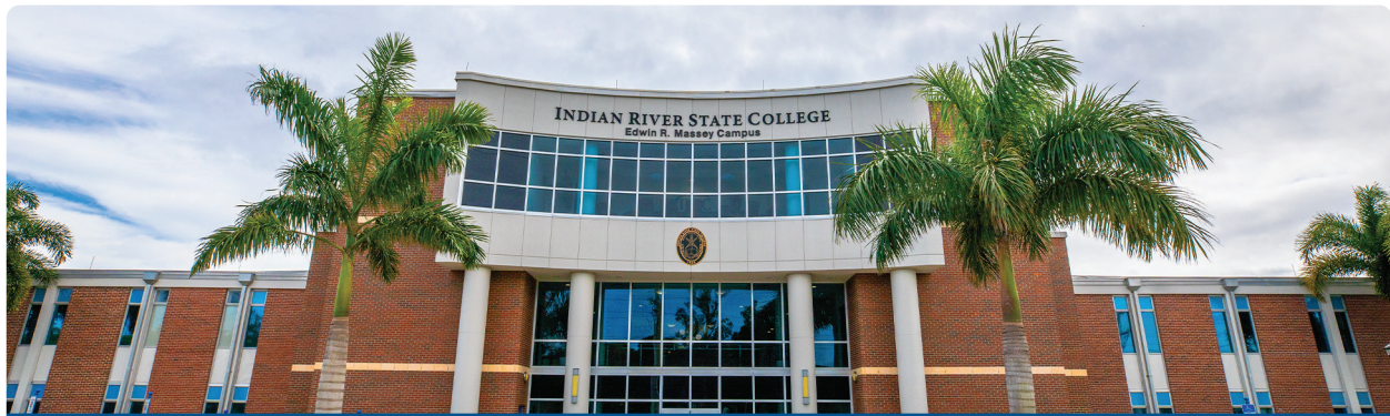
IRSC Massey Campus

Indian River State College (IRSC) is a comprehensive institution accredited to offer Associate and Baccalaureate Degrees, along with Career and Technical Certificates. Renowned for its role in education and innovation, IRSC is committed to transforming lives through high-quality, affordable, and accessible education, leveraging both traditional and remote delivery methods. In 2018, IRSC was recognized as a National Center of Academic Excellence in Cyber Defense, underscoring its dedication to providing top-tier Cyber Security training to students and local organizations via its degree programs and the Cyber Security Institute (CSI).