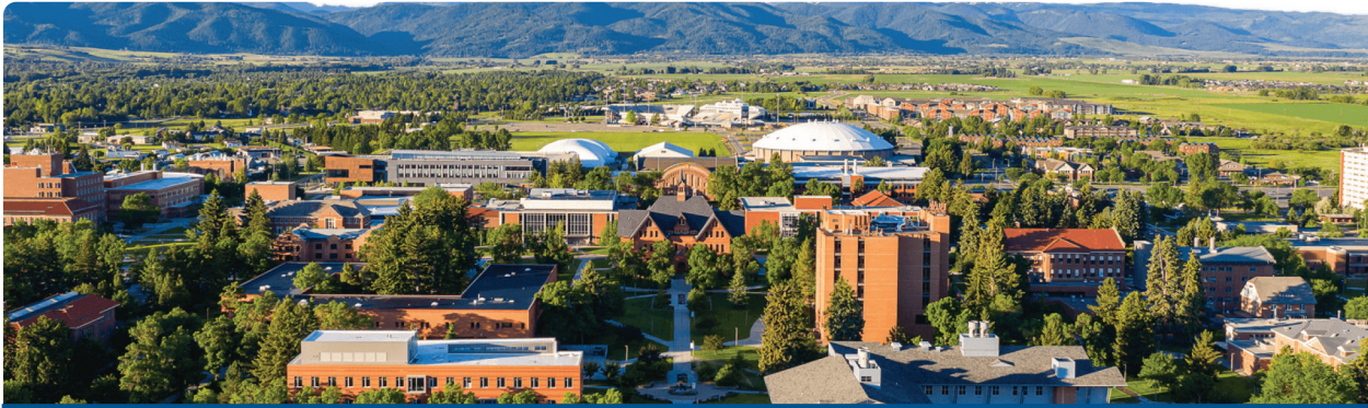
Montana State University campus in Bozeman, MT.

Gallatin College Montana State University (MSU) , located in Bozeman, Montana offers programs that accelerate the time to graduation and the start of a successful career. The Information Technology (IT) Cybersecurity and Information Assurance programs prepare students to support the information security needs of businesses. Program graduates are able to identify cyber threats, implement and maintain proper security measures, respond to system intrusions, and provide creative solutions to emerging risks. Students are also prepared to sit for numerous certifications including: CompTIA Security+, CompTIA Network+, CompTIA CySA+, and EC-Council's Certified Ethical Hacker.