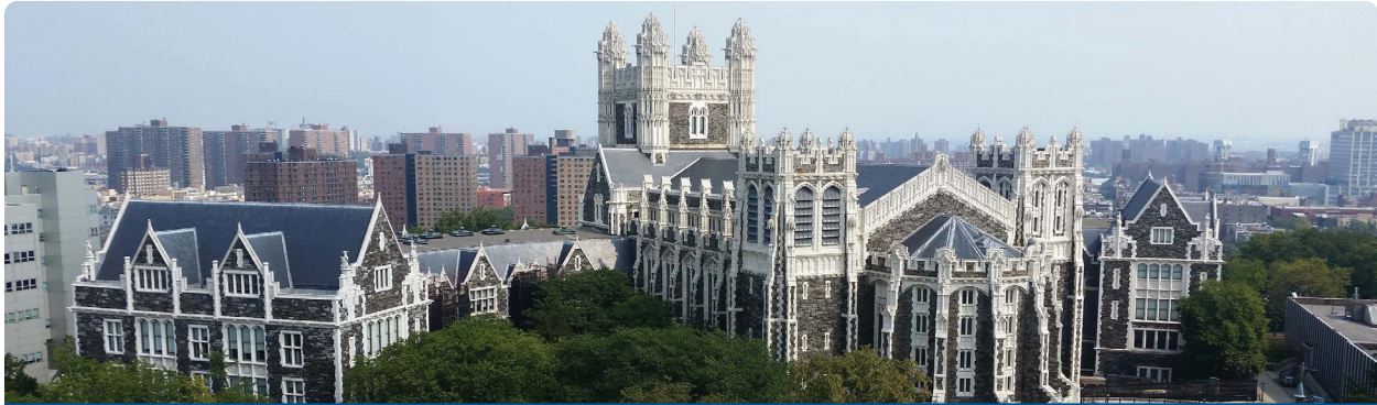
The City College of New York (CCNY)

The Cybersecurity M.S. Program at The City College of New York was developed in partnership with the New York City Economic Development Corporation (NYCEDC) to augment the cybersecurity talent pipeline for the city’s public and private organizations. The curriculum combines a theoretical foundation with applied learning training to produce well-rounded cybersecurity practitioners.