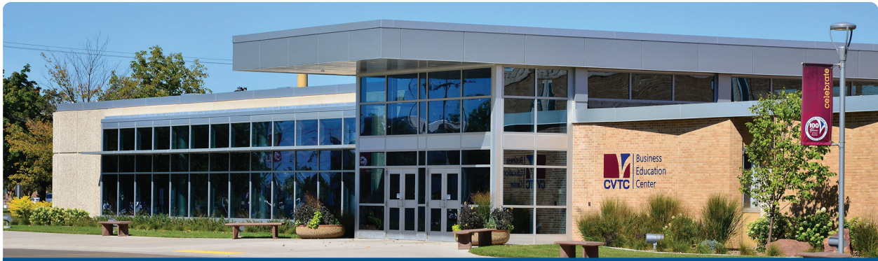
CVTC Main Campus

Chippewa Valley Technical College has served its 11-county district of Wisconsin since 1912, training graduates to fill positions in a wide range of fields. The IT-Network Specialist program at CVTC gives students a hands-on education that goes beyond the conceptual and focuses on practical applications of technology. The IT-NS program has a strong focus on problem solving throughout its courses. Students gain a solid foundation in core IT disciplines of networking, systems administration, and cybersecurity.