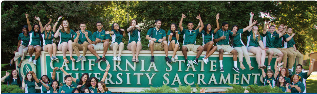
Students at CSUS

In 2005, the Department of Computer Science within the College of Engineering and Computer Science (ECS) at California State University, Sacramento (Sacramento State) , established the Center for Information Assurance and Security (CIAS) with a mission to enhance knowledge in information assurance and security. This mission is realized through several core activities, including education, training, and awareness programs focused on information assurance and security issues and practices.