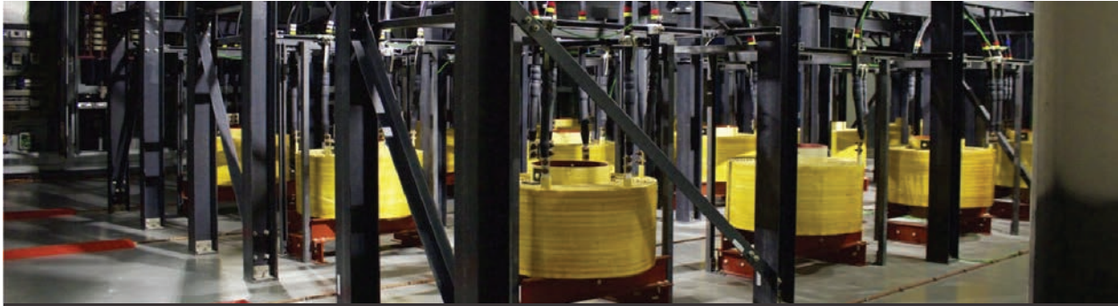
The Duke Energy Electrical Grid Research Innovation and Development center (eGRID) at Clemson can simulate the electrical grid of any country in the world to test how cities would manage cyberattacks to power infrastructure

Clemson University continues to develop research infrastructure, educational programs, and faculty expertise in alignment with national security interests in cybersecurity.